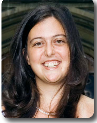
The Rev. Dr. William J. Barber, II The Rev. Dr. Liz Theoharis National Co-Chairs, Poor People's Campaign: A National Call for Moral Revival